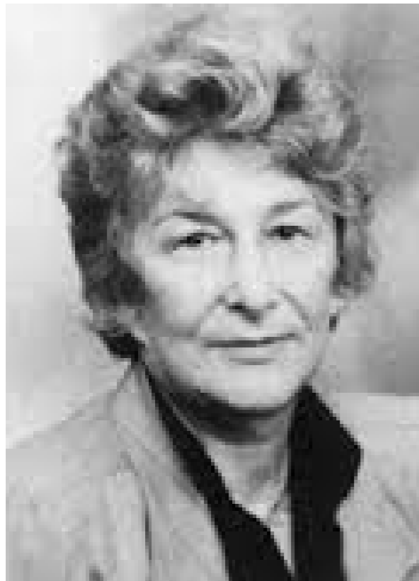
Yvette Roudy Hanja Maij-Weggen