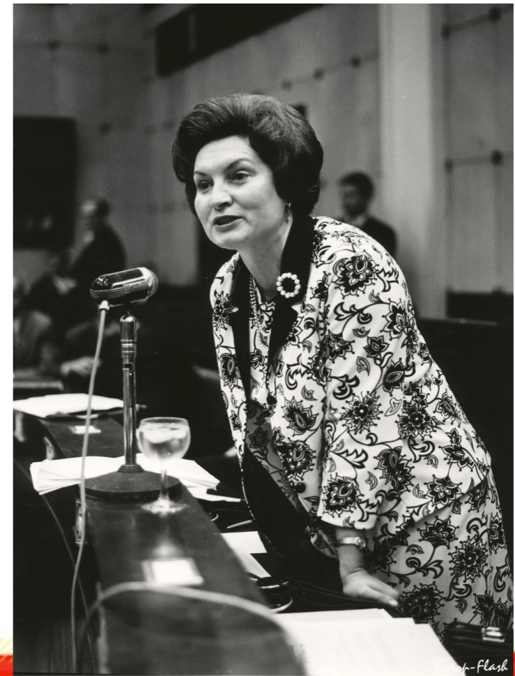
Henk Vredeling, Cornelis Berkhouwer, Astrid Lulling